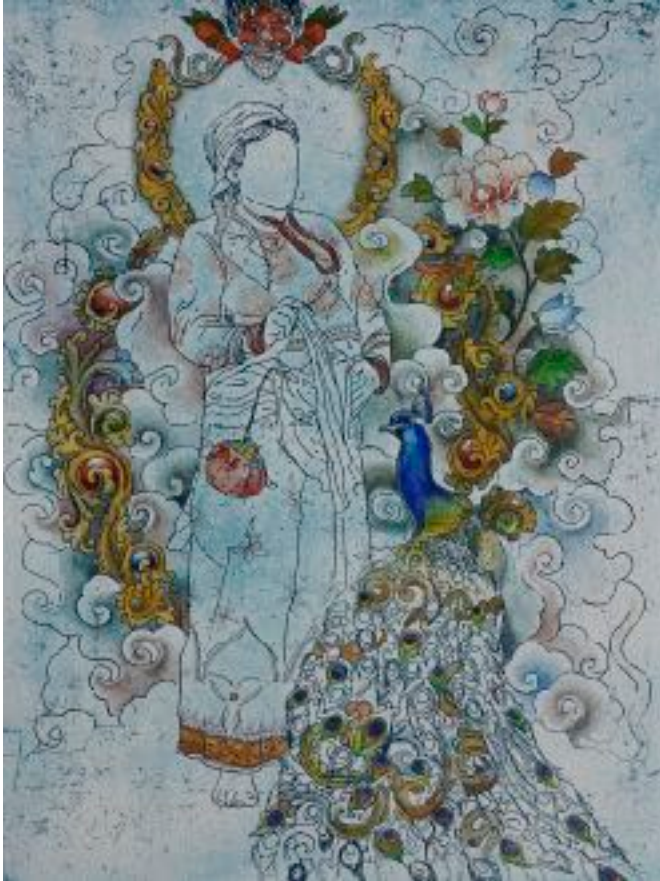
Sauranga Darshandhari (Mhicha) Pouch Etching 9.5 x 13 inches 2018