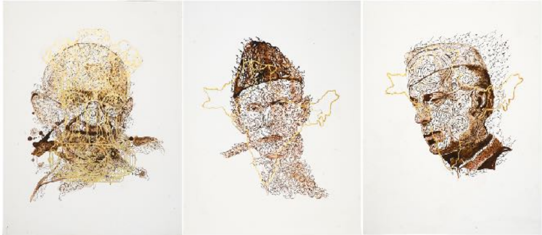
Mahbubur Rahman Heros I Earth colour and gold leaf on paper 14 x 11 inches each Set of 3 2018