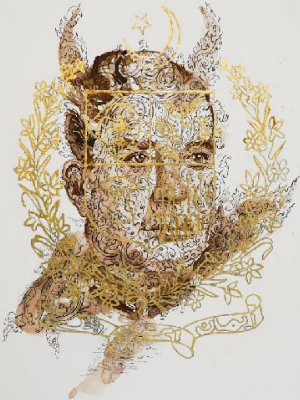
Mahbubur Rahman Heros Earth colour and gold leaf on paper 14 x 11 inches 2018