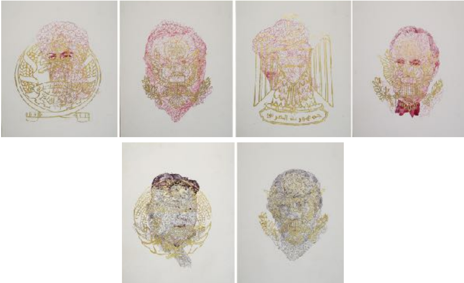
Mahbubur Rahman Heros II Earth colour and gold leaf on paper 14 x 11 inches each Set of 6 2018