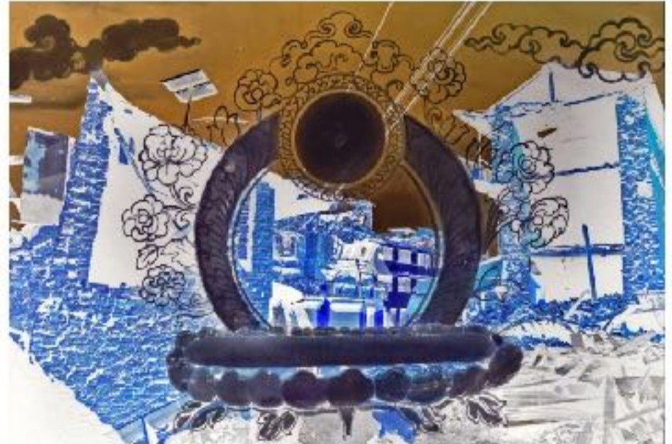
M Pravat with Saru Prajapati Forces of Attraction and Repulsion Chemical on print and digital print on archival fine art paper 14 x 20 inches each (diptych) 2018