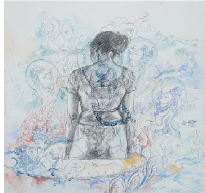
Tayeba Begum Lipi Chhinnamasta Pencil and earth colour on paper 15 x 14 inches 2018