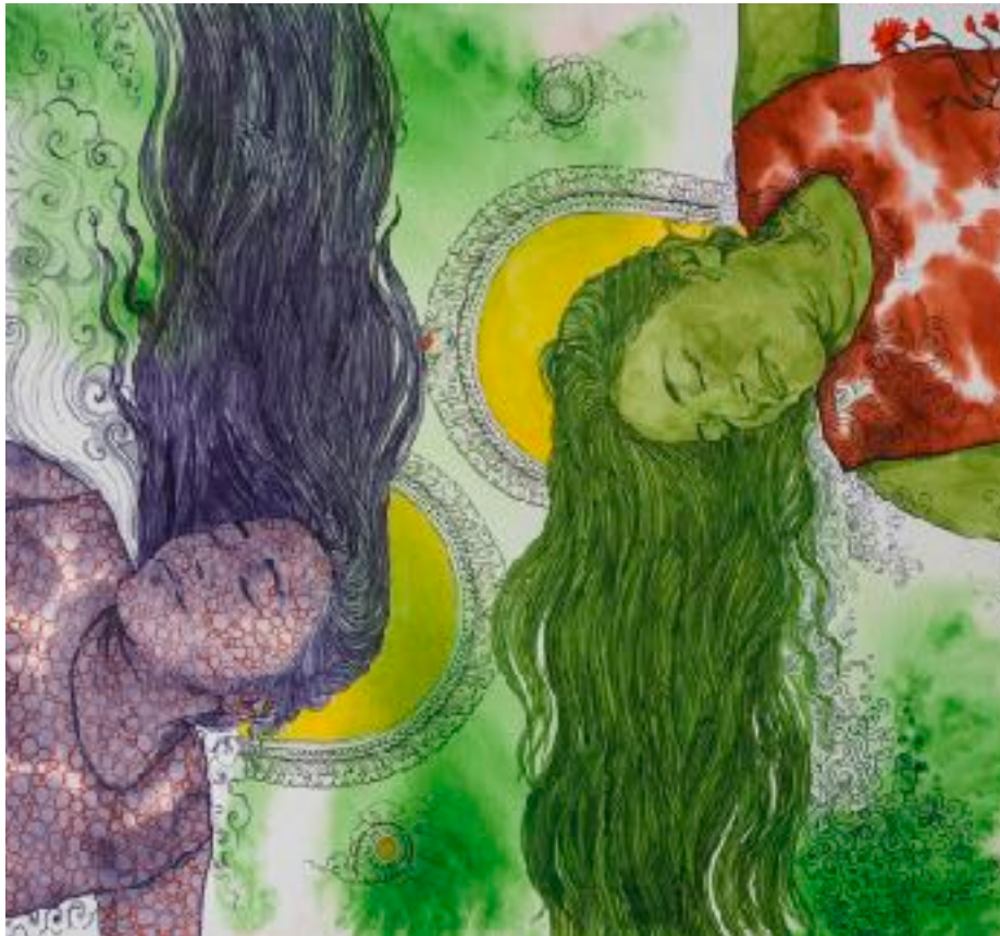
Prithvi Shrestha Up and Down Watercolour on paper 16.8 x 19.6 inches 2018