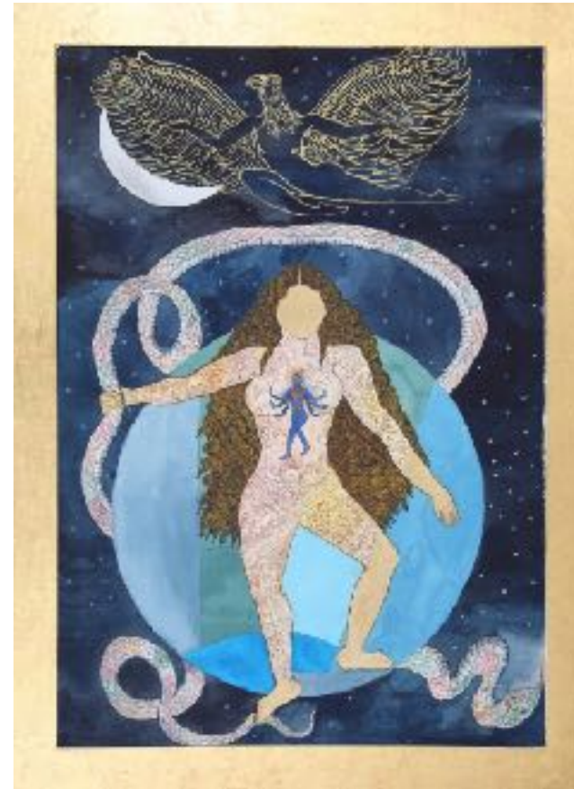
Seema Kohli Narrative and Songs of Hiranyagarbha of Garuda and Vasuki Series Pen, ink, watercolor and 24ct gold leaf on paper 30 x 22 inches 2018