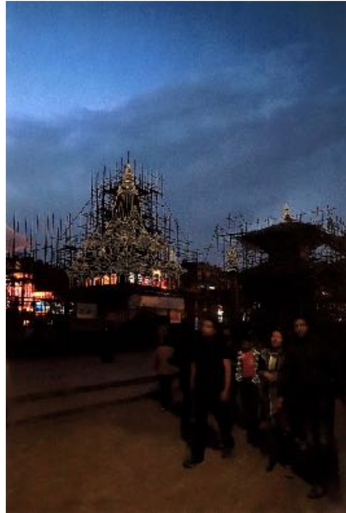
Maria Waseem Untitled Drawing with Pigment colour on photograph, print on Archival paper 17.2 x 11.5 inches 2018