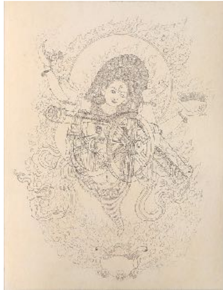
Waseem Ahmed Untitled Silver point on Archival Wasli paper 13.1 x 9.9 inches 2018