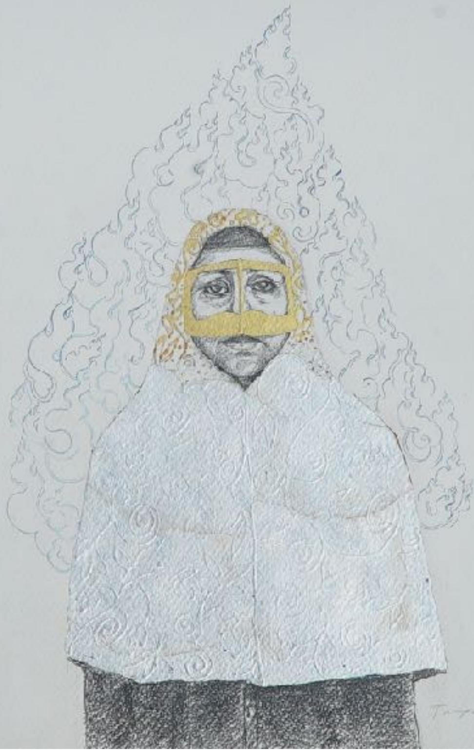
Tayeba Begum Lipi The Shell Pencil, silver leaf and earth colour on paper 15 x 14 inches 2018