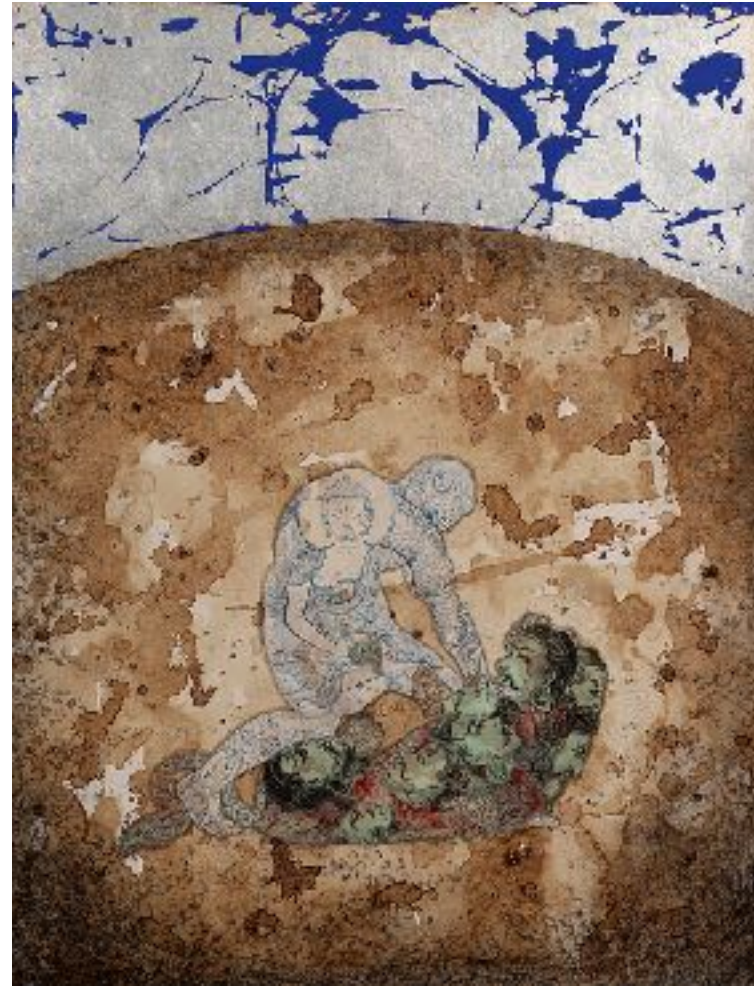
Waseem Ahmed Untitled Pigment colour, silver leaf, tea stain on Archival Wasli paper 13.5 x 10.2 inches 2018