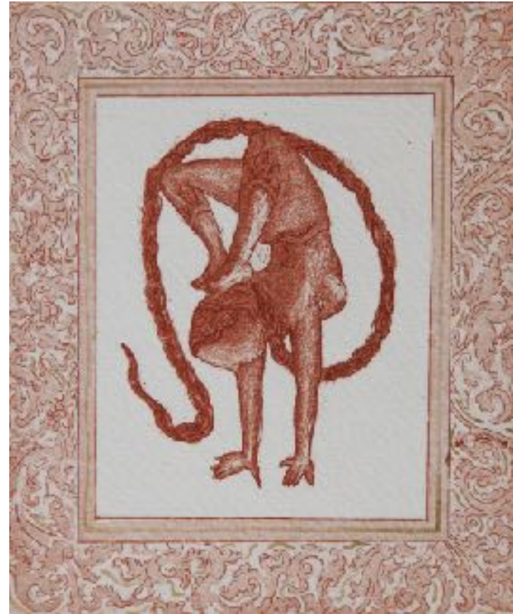
Seema Kohli Yogini 1 Zinc plate etching prints on fabriano paper with 24ct gold leaf and gold paint Edition 1 of 12 6.6 x 6.9 inches 2019