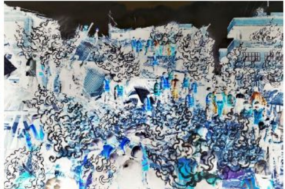
M Pravat with Saru Prajapati Forces of Attraction and Repulsion Chemical on print and digital print on archival fine art paper 14 x 20 inches each (diptych) 2018