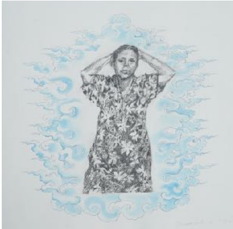
Tayeba Begum Lipi Lost in Cloud Pencil and earth colour on paper 15 x 14 inches 2018