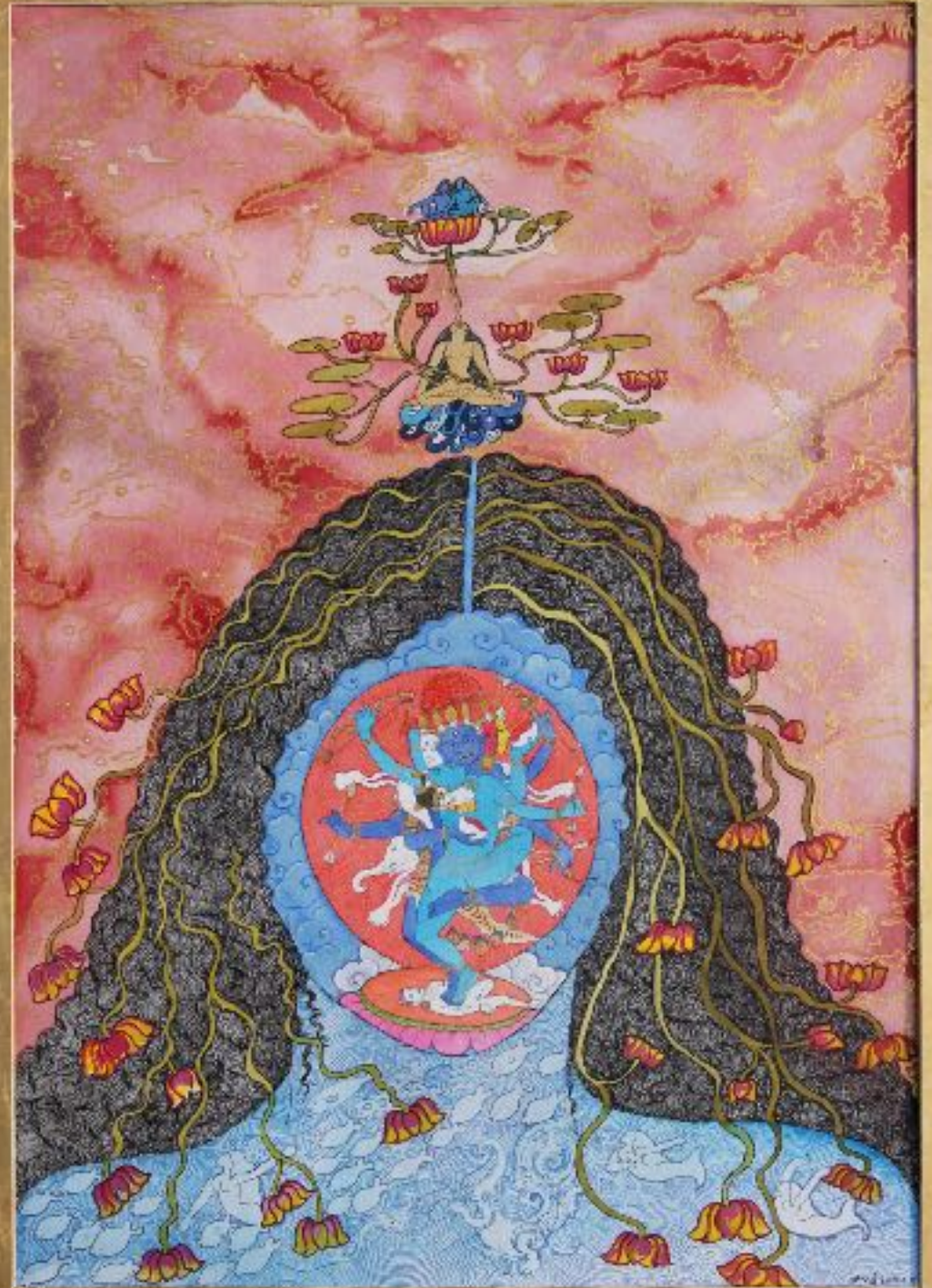
Seema Kohli Narrative and Songs of Hiranyagarbha of Yogamaya Series Pen, ink, watercolor and 24ct gold leaf on Paper 30 x 22 inches 2018