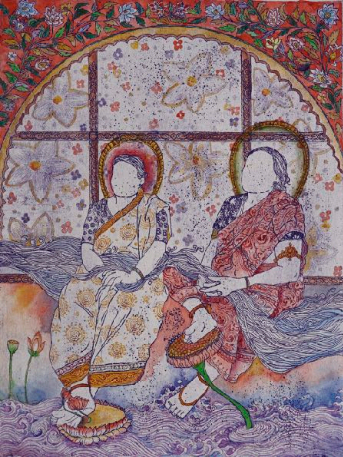
Sauganga Darshandhari Maa and Mama Etching 9.5 x 13 inches 2018