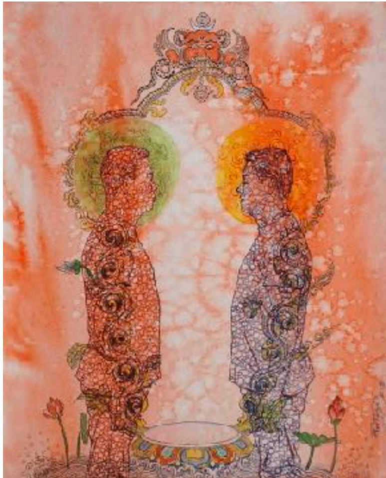
Prithvi Shrestha With You I Watercolour on paper 13.5 x 16.14 inches 2018