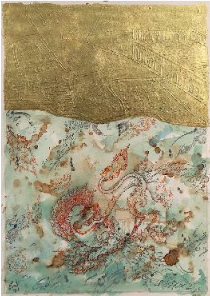
Waseem Ahmed Untitled Pigment colour, gold leaf, tea stain on Archival Wasli paper 13.3 x 9.4 inches 2018