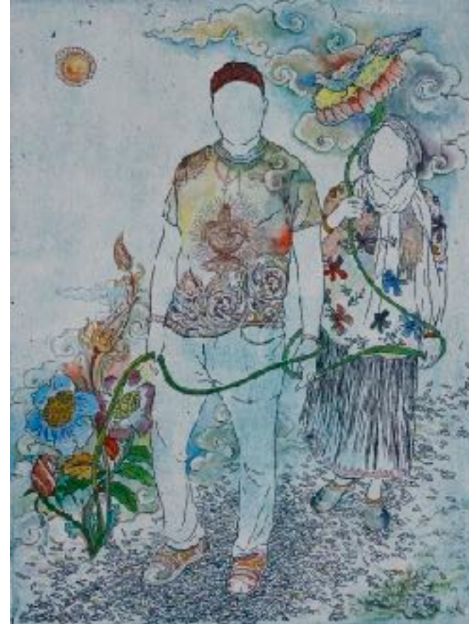
Sauranga Darshandhari Connection Between Me and Food Etching 9.5 x 13 inches 2018