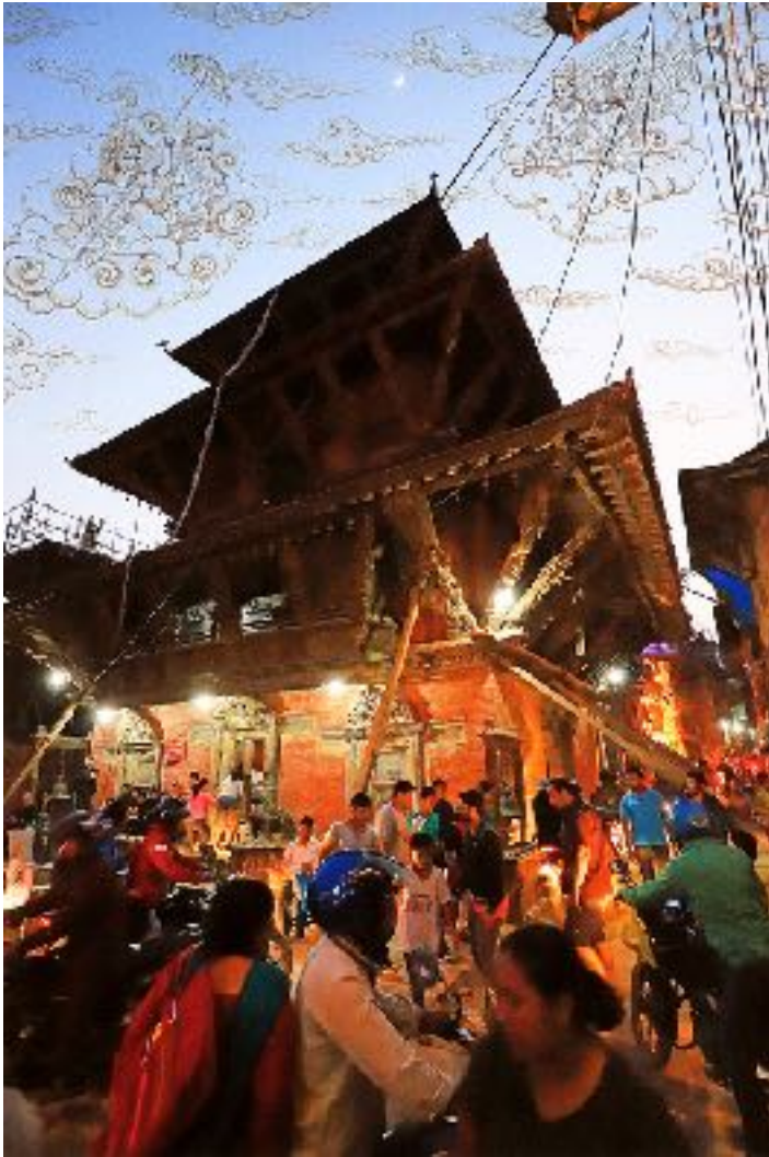
Maria Waseem Untitled Drawing with Pigment colour on photograph, print on Archival paper 17.2 x 11.5 inches 2018