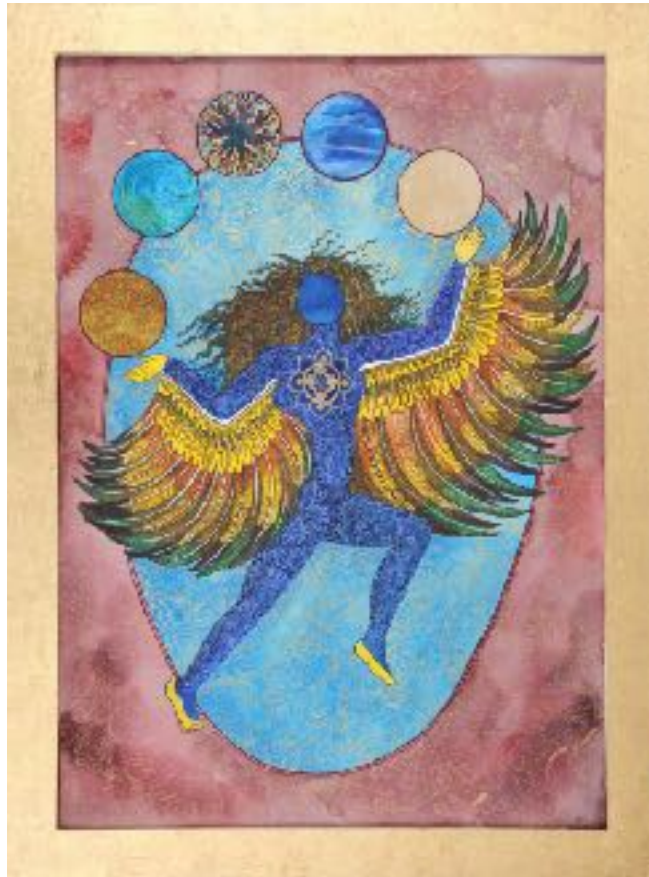
Seema Kohli Narrative and Songs of Hiranyagarbha of Dakini Winds and Fire Series Pen, ink, watercolor and 24ct gold leaf on paper 30 x 22 inches 2018