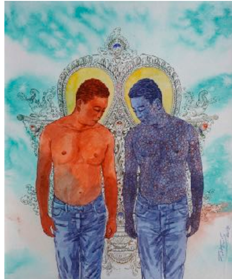
Prithvi Shrestha With You III Watercolour on paper 12 x 14.1 inches 2018