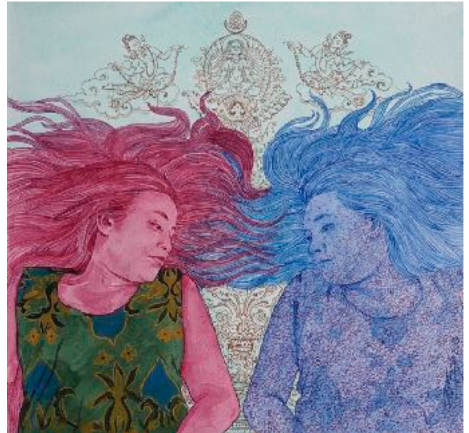
Prithvi Shrestha With You II Watercolour on paper 12.7 x 13.7 inches 2018