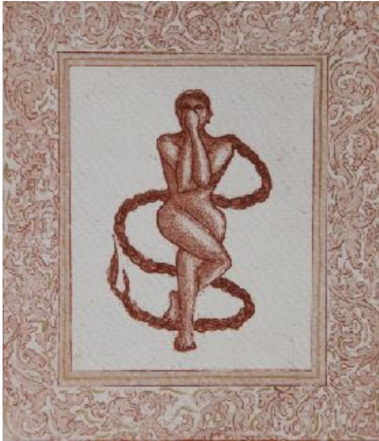
Seema Kohli Yogini 3 Zinc plate etching prints on fabriano paper with 24ct gold leaf and gold paint Edition 1 of 11 6.6 x 5.9 inches 2019