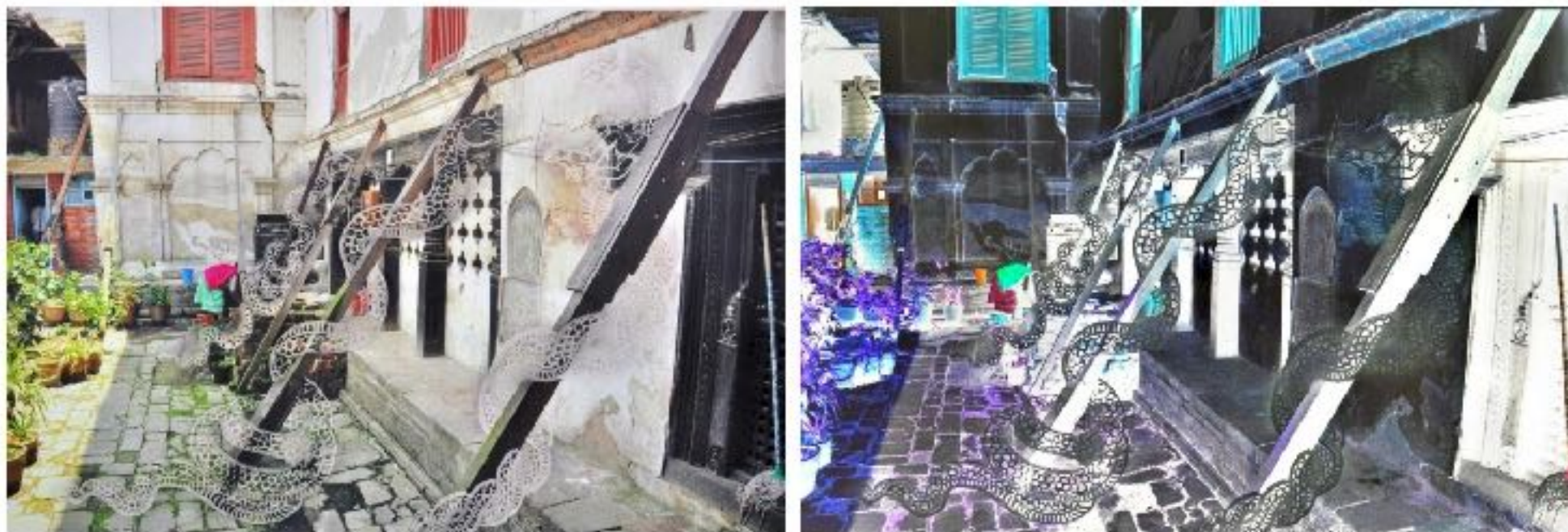
M Pravat with Saru Prajapati Forces of Attraction and Repulsion Chemical on print and digital print on archival fine art paper 14 x 20 inches each (diptych) 2018