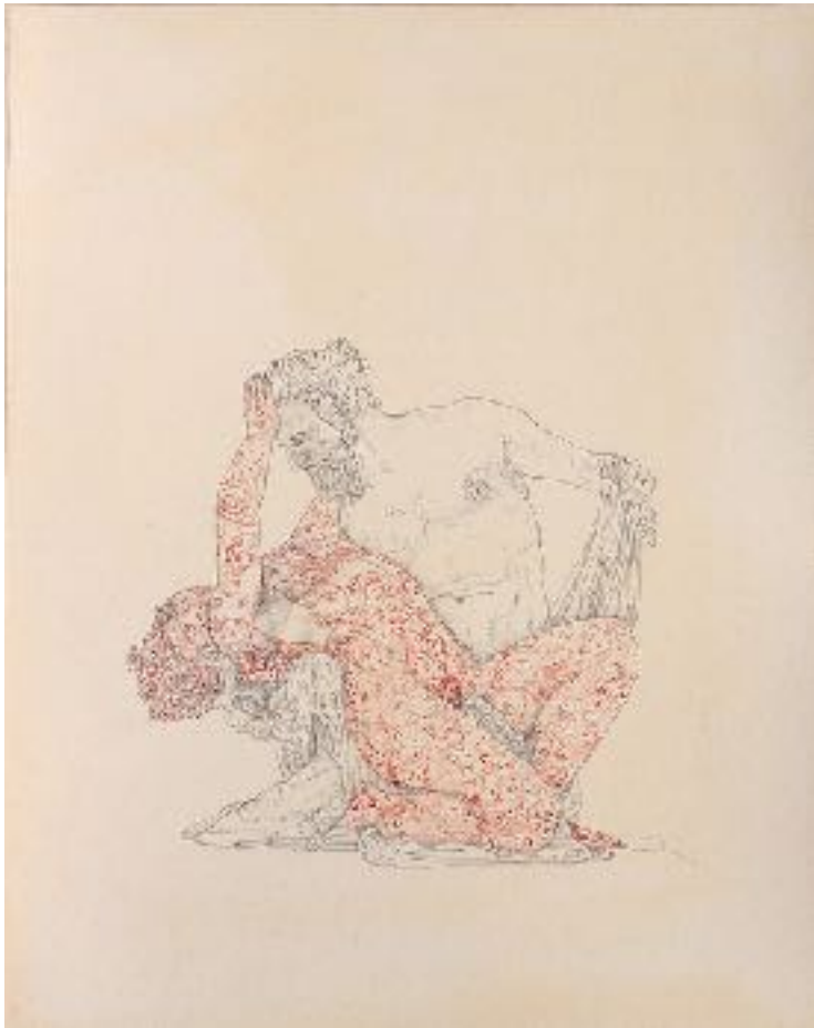
Waseem Ahmed Untitled Silver point on Archival Wasli paper 13.1 x 9.9 inches 2018