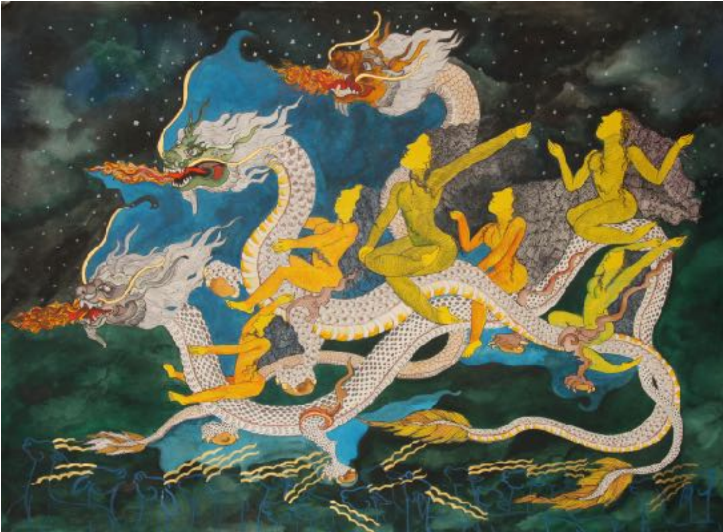
Seema Kohli Narratives and Songs of Hiranagarbha of Riding of Winds Pen, ink, watercolor and 24ct gold leaf on Paper 25 x 33 inches 2019